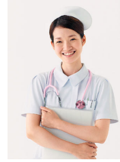
护士 hu shi