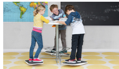
站起来 zhan qi lai