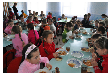
餐厅 cān tīng