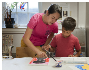
顾问 gù wèn