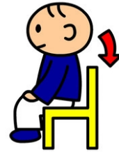
坐下 zuo xia