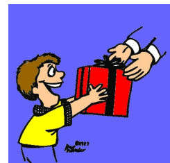
谢谢 Xie xie