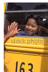
再见 Zài jiàn