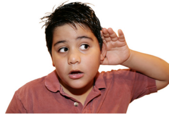
再说一次 zai shou yi ci